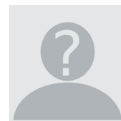
Social Media Chair